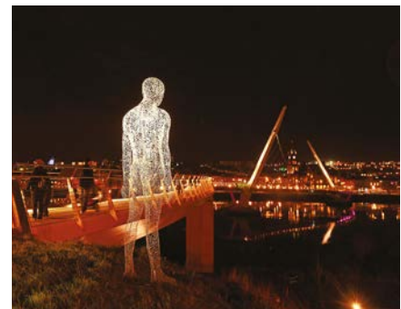
The Peace Bridge in Derry~Londonderry